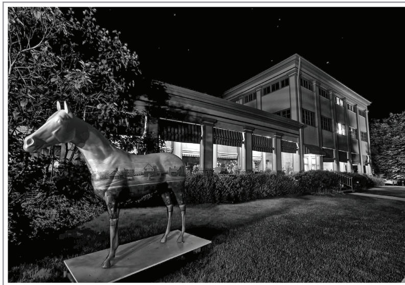
"THE INN BY STARLIGHT" BY PETER POTTER

The 2020 Roycrofters at Large Association Membership premium is a limited edition photographic print entitled, "The Inn by Starlight," by Roycroft Artisan Peter Potter. The 5" x 7" image is printed on Fuji Deep Matte paper and double matted by hand to fit an 8 x 10 frame. The black-and-white print is hand numbered and lettered and carries the Double R Orb mark. The edition is limited to 100.